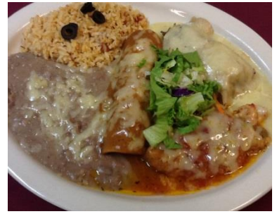
Combo # 12