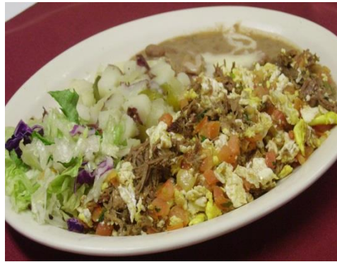
Huevos con Machaca