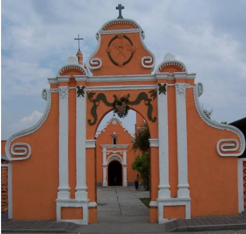
San Luis Coyotzingo, Pue