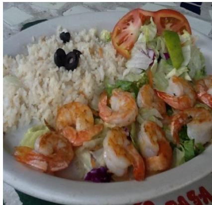
Shrimp A la Plancha