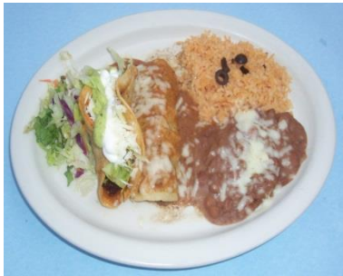
Combo # 2