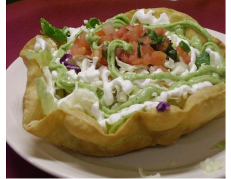
Casa Mañana Tostada

Macho Chimichanga Giant Chimichanga stuffed with rice, beans and your choice of meat, covered with cheese dip, sour cream and guacamole 8.99