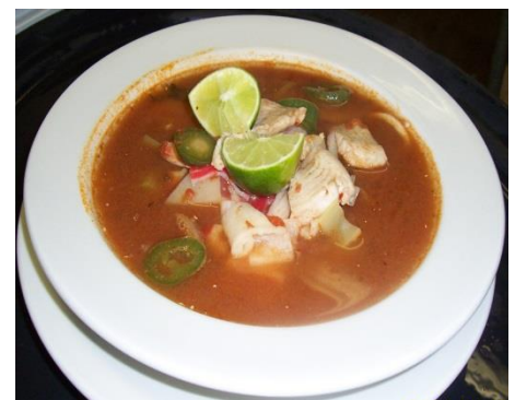
Seven Seas Soup