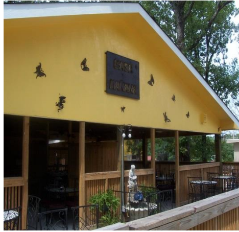
Casa Mañana West