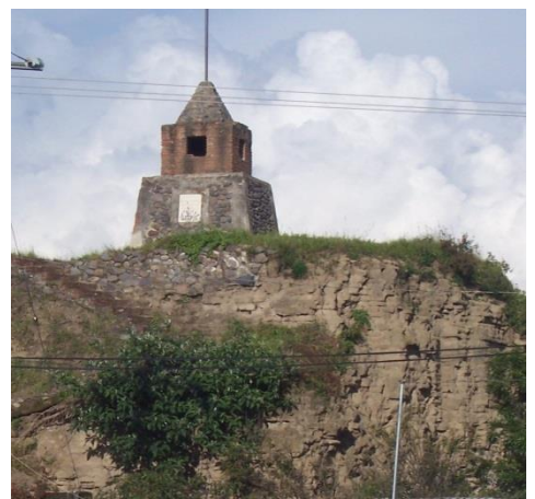
San Luis Coyotzingo, Pue

18321 Cantrell Rd. Little Rock, AR 72223