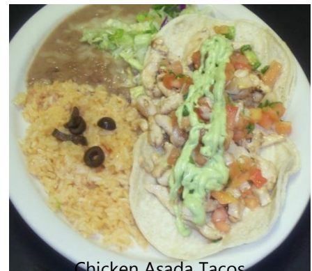
Chicken Asada Tacos

Taco Marinero Two soft tacos filled with sautéed big shrimp, mixed with onion, chorizo and bell pepper or jalapeño. Topped with melted cheese. 11.49