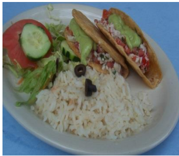
Combo # 8