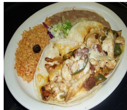
Tacos San Martin